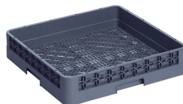
AF11013 Plate Rack 500mm Sq/100mm deep Grey