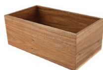
RSR-WD3218 Acacia Wood Boxes/Risers GN 1/3 - 32.5 x 18 x 12.3cm