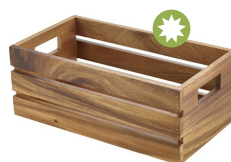
RSR-W3218 Acacia Wood Boxes/Risers GN 1/3 - 32.5 x 18 x 12.3cm