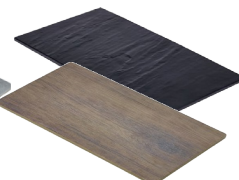
MEL13-WD Wood Effect Melamine Platter GN 1/3