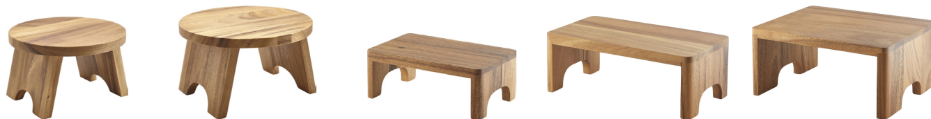
RSR-WR25 Acacia Wood Round Riser 25 x 15cm

Great for buffets and coffee shop displays as well as 'at the Table' sharing platters.