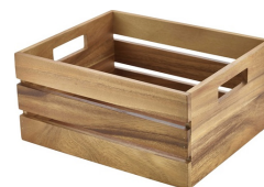
RSR-W3226 Acacia Wood Boxes/Risers GN 1/2 - 32.5 x 26.5 x 15.3cm