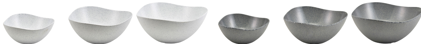
MELTRB-25W White Bowl 2.5L/87.6oz 25 x 11.5cm

Great for use in any food service, buffet or display area. Features an attractive matt finish on the outside and a durable gloss finish on the inside.