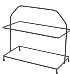
MDS1313 Two-Tier Display Stand 34 x 16.8 x 30.5cm