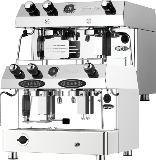
More Fracino machines & accessories available online!