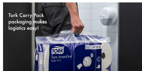
Tork Carry Pack packaging makes logistics easy!

SmartCore simplifies dispenser loading with its innovative, easy-to-grab tail that pulls out fast to save time.